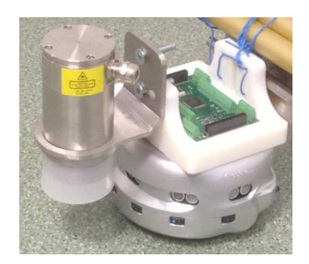
Figure 3: Khepera robot equipped with a Laser pyrometer

On this same surface several mobile robots will be equipped with pyrometers laser (figure 3) to measure the temperature of the plate on a small area (a few mm2).Their locations and the measured temperature will be transmitted to a central computer via a wireless (WIFI) technology.